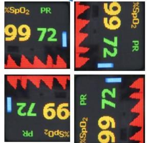
Display PI value